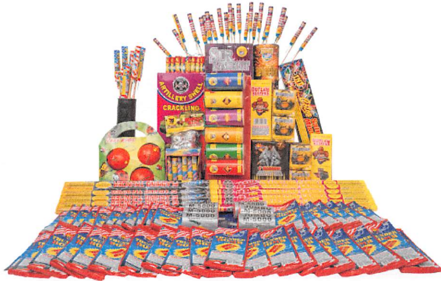
EXAMPLE OF HOW THEY WILL LEAVE EEI CAMPUS